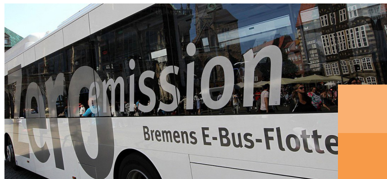
Electric bus in Bremen.

ELIPTIC Project Coordinator, City of Bremen