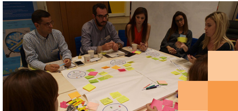
Social Entrepreneurship Workshop in Thessaloniki.

Combine co-creation workshops with input from an expert board or jury to ensure that both users and experts are involved in evaluating your campaign and its ideas.